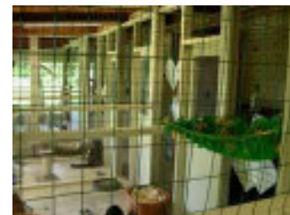
Above: Volunteers installed six new communal living areas in the Cattery. These group homes result in happier and healthier cats.