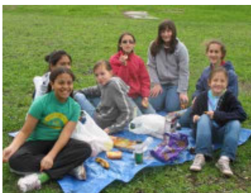
Above: Girl Scouts from Troop 1609 spent a day working at the HSWC to earn their Bronze Awards