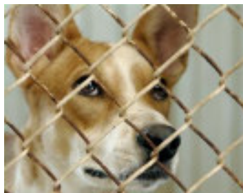
Right: Sweetie an HSWC resident featured on a “Sheltered” episode at OnNetworks.com