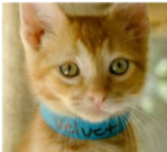
Left: Velvet an HSWC resident featured in one of the top “Sheltered” episodes at OnNetworks.com